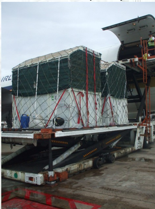
The giraffes being unloaded from SQ7343

The giraffes flew SQ7343 on July 27, and arrived safely the next day in Pudong, from where they were trucked to their new home in Tianjin. – By Joanne Greer, Johannesburg