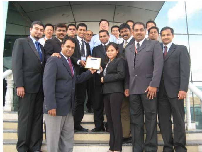
Bangalore team and business partners