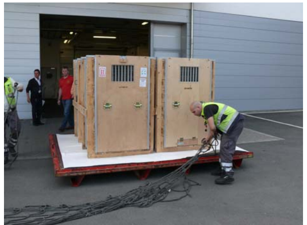
The two boxes with the sloth bears are secured for uplift into the aircraft.