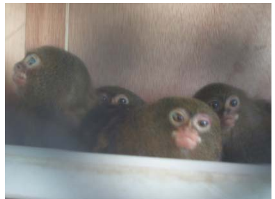
The family of four titis awaiting their flight to Adelaide