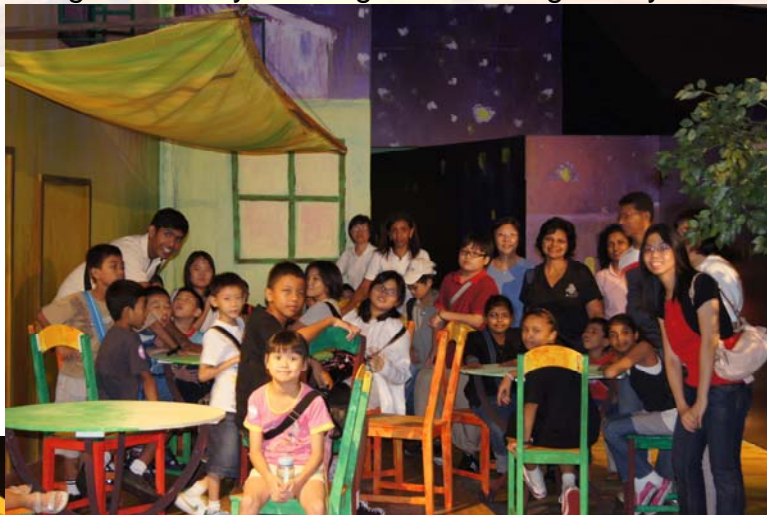
Left : Volunteers and children posing in the real-life reproduction of Van Gogh's "Cafe Terrace at Night."

It was obvious that they tremendously enjoyed the educational outing. We volunteers, too, had a lovely time spending a Saturday morning in a meaningful way.