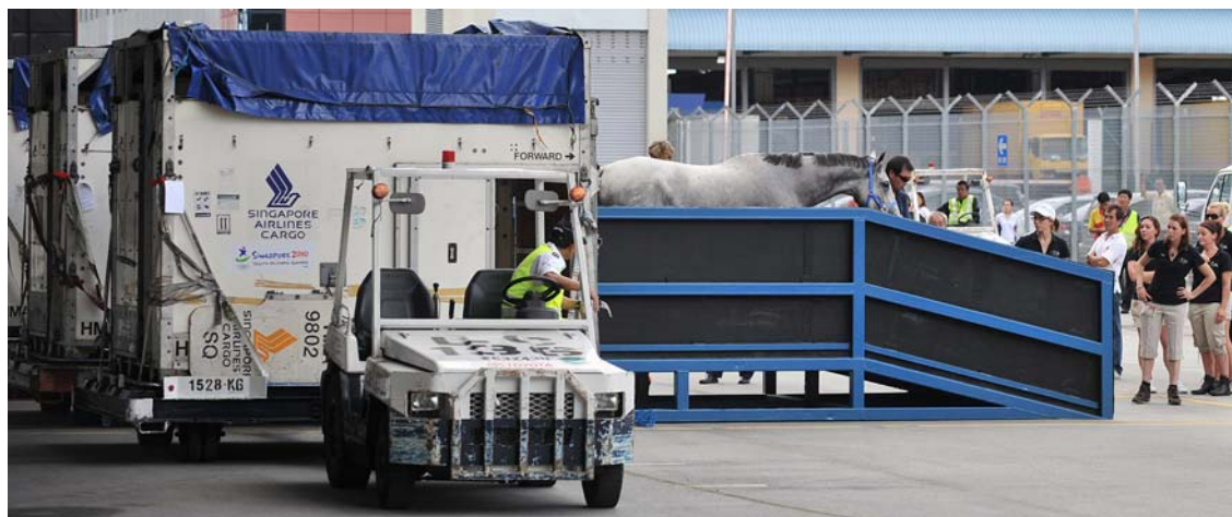
A horse being led out of an HMA (special pallet for horses) on arrival in Singapore on July 15

After arrival in Singapore, the 38 horses were led into special trucks for the road journey to the Singapore Turf Club Riding Centre — the venue of the equestrian competition.