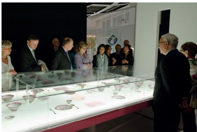
Left picture : Visitors admiring the traditional Peranakan cutlery