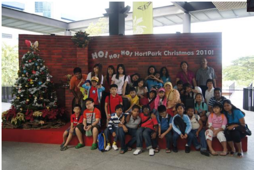
The volunteers and children at the HortPark