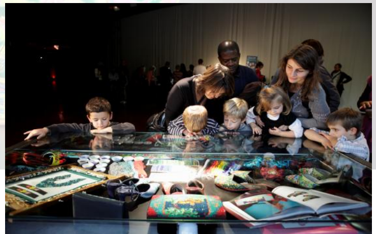
Top picture : Peranakan costumes and visitors admiring the exquisite hand-made beaded items