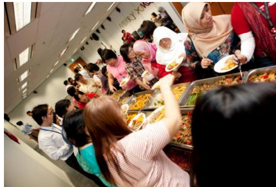
Left picture :A group photograph with Mr Goh