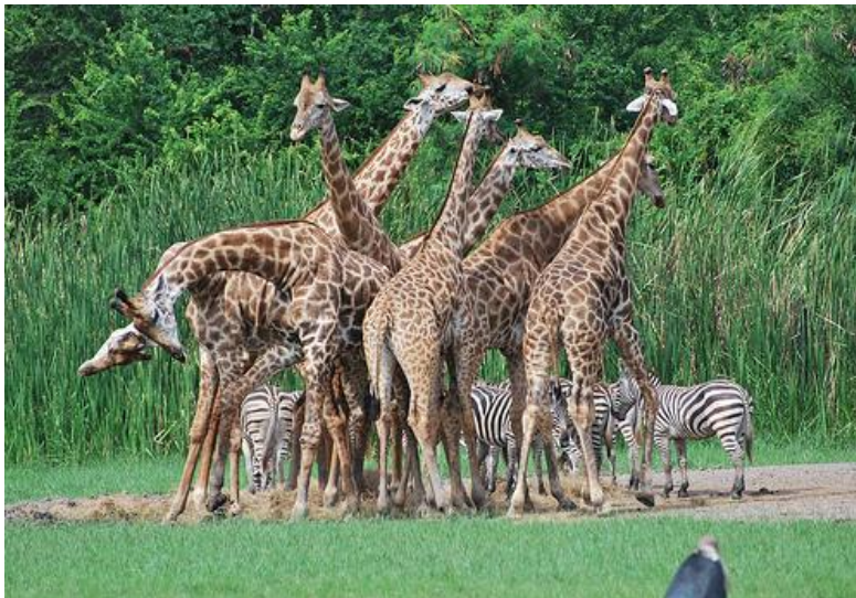
Some of the giraffes that flew from Johannesburg to Bangkok