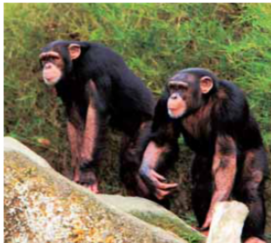
Makhulu and Manzi.

Singapore Zoo has a very successful captive breeding programme, helping boost the population of some of the most critically endangered animals. Last year alone, the Zoo successfully bred 93 animals, including endangered animals