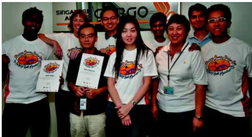
Some of the 11 Cargo staff who took part in the SAFRA Sheares Bridge Run, not to win, but to raise funds for SIA Cargo's adopted charity.

returned to St Andrews Road via the National Stadium and the very picturesque Marina Promenade.