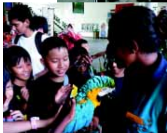
Volunteers bring joy to their charges on Children's Day at an outing in Sentosa.

mathematics fun through the use of interesting computer programmes. Volunteers round up the sessions by engaging children in challenging board games. And, once a month, a