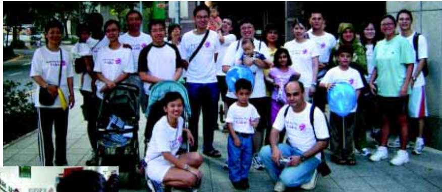
Staff and their families getting set to "Walk for the Children", a fund raising event for their adopted charity.

Five volunteers spend three hours, twice a week at the Henderson Children Centre. They help the children with their school work, teach them art and craft and make learning